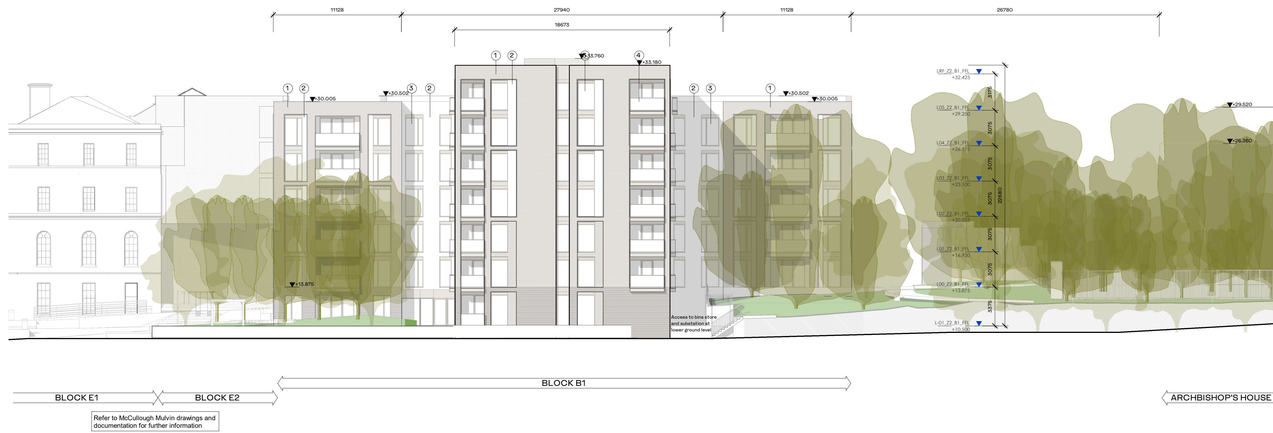
1 Block B1 Proposed North Elevation 1 : 200