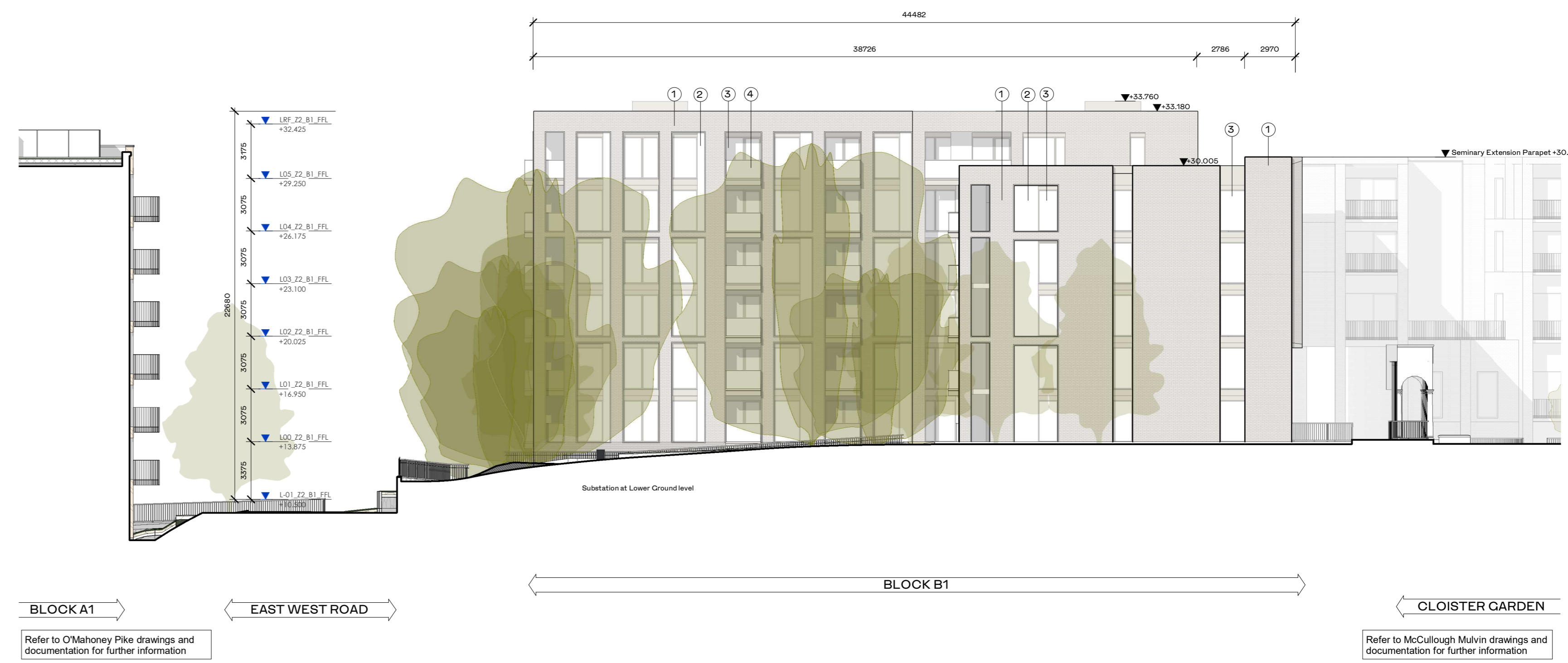
4 Block B1 Proposed West Elevation 1 : 200